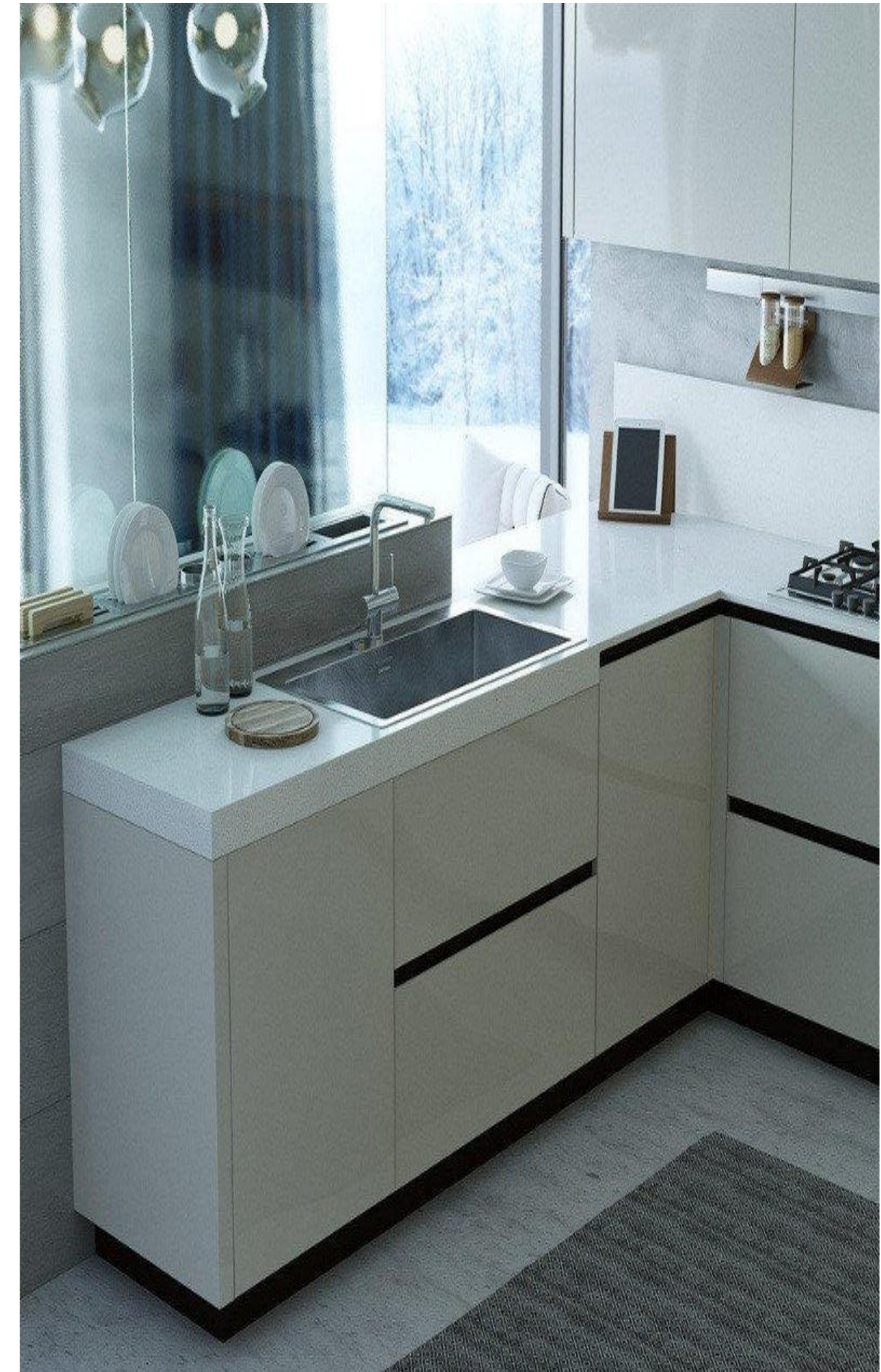
| KITCHENS. DESIGN IDEAS | KÜCHEN. DESIGN-IDEEN