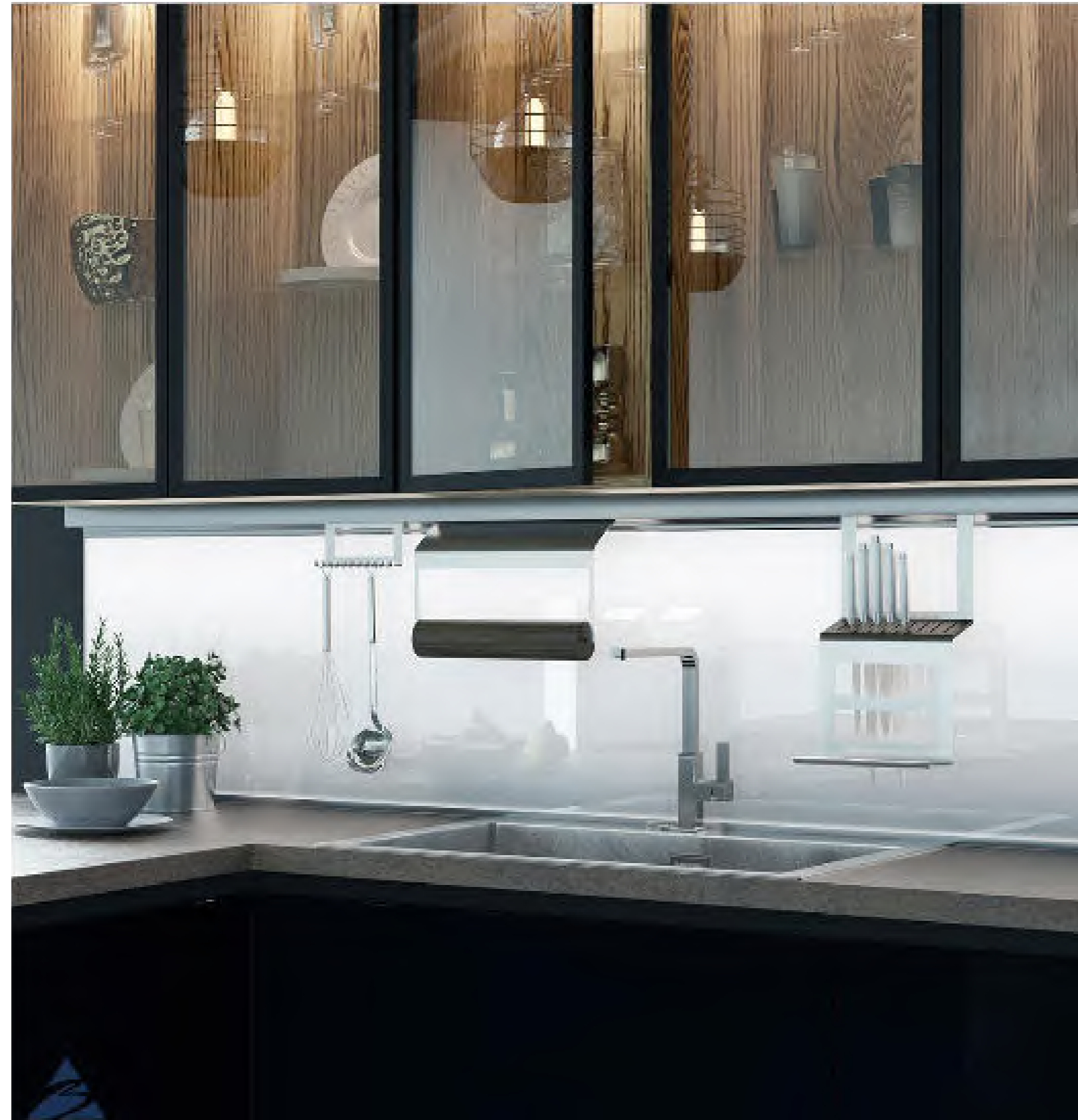
| KITCHENS FOR GREATER INDIVIDUALITY | KÜCHEN FÜR MEHR INDIVIDUALITÄT