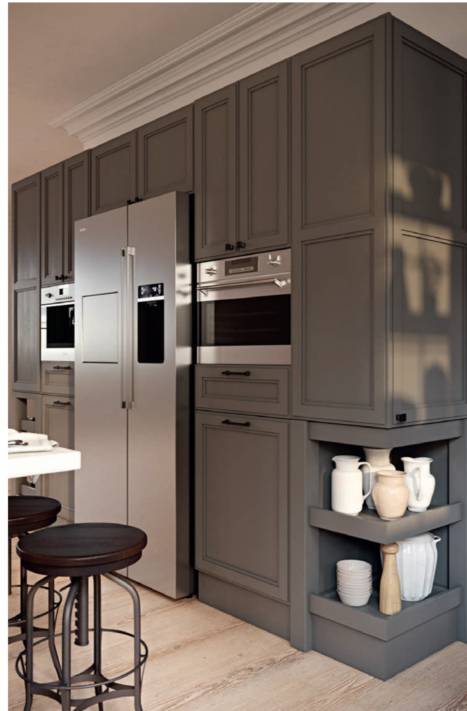
| KITCHENS. DESIGN IDEAS | KÜCHEN. DESIGN-IDEEN