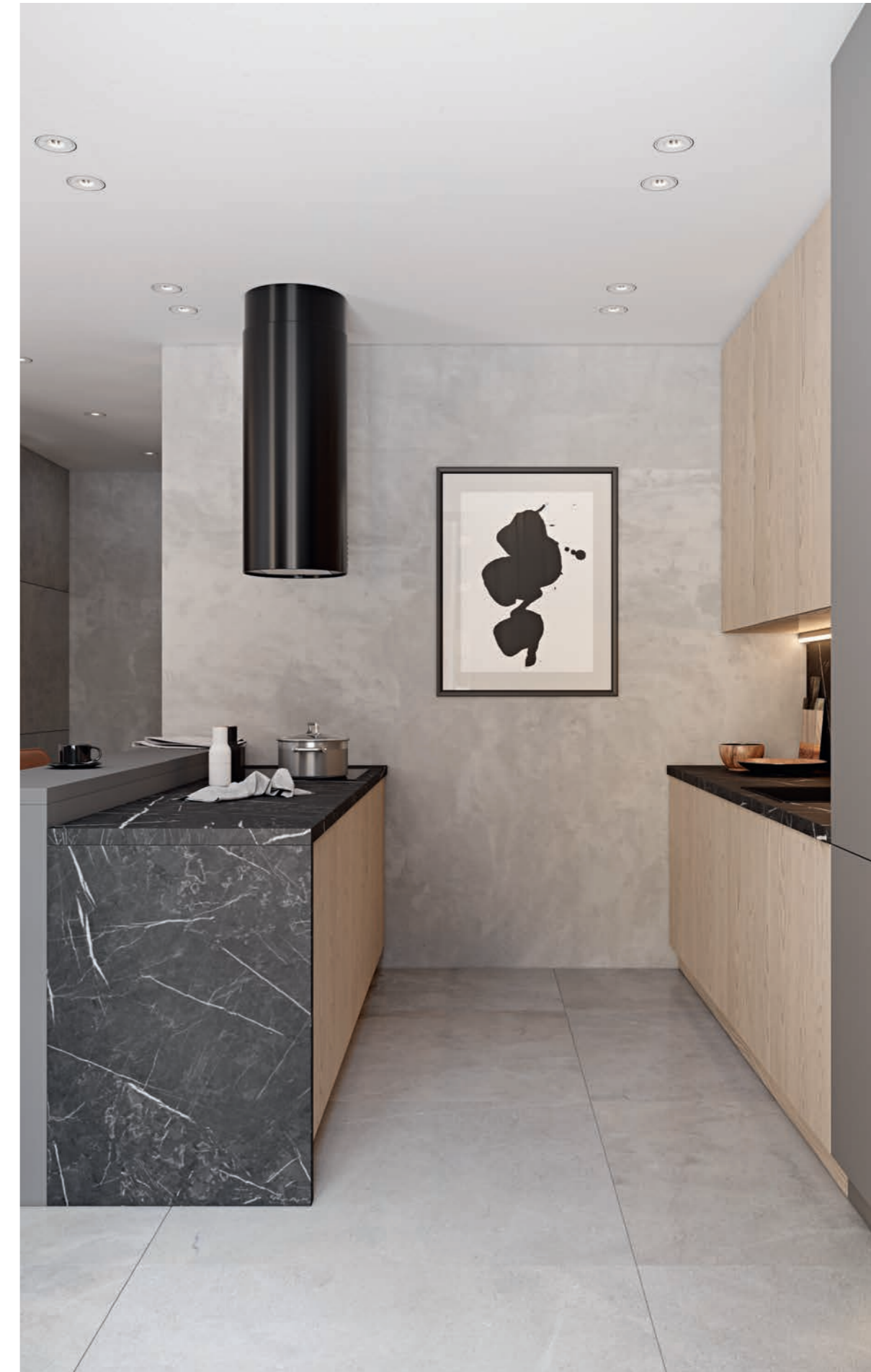
| KITCHENS. DESIGN IDEAS | KÜCHEN. DESIGN-IDEEN