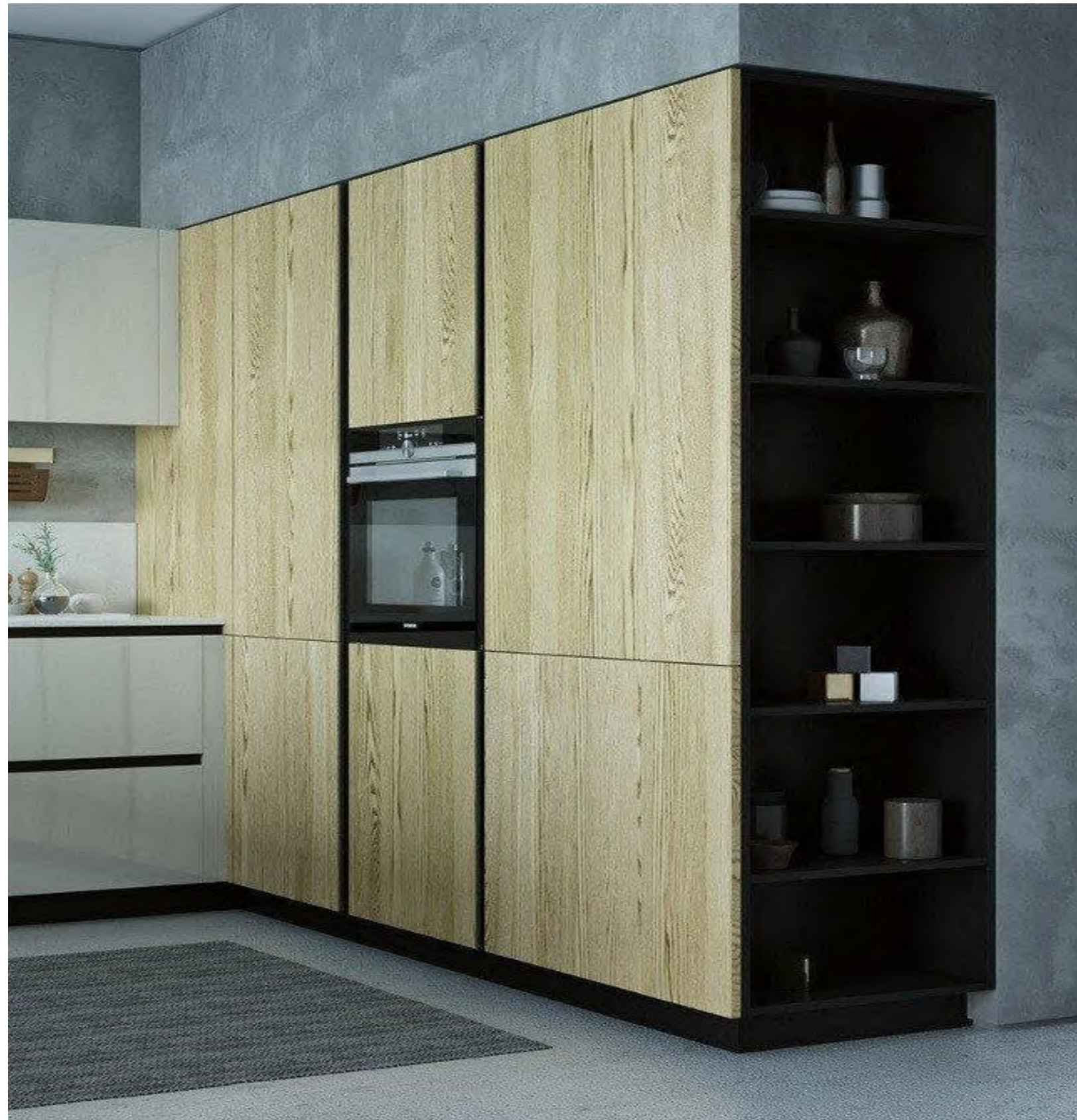
| KITCHENS FOR GREATER INDIVIDUALITY | KÜCHEN FÜR MEHR INDIVIDUALITÄT