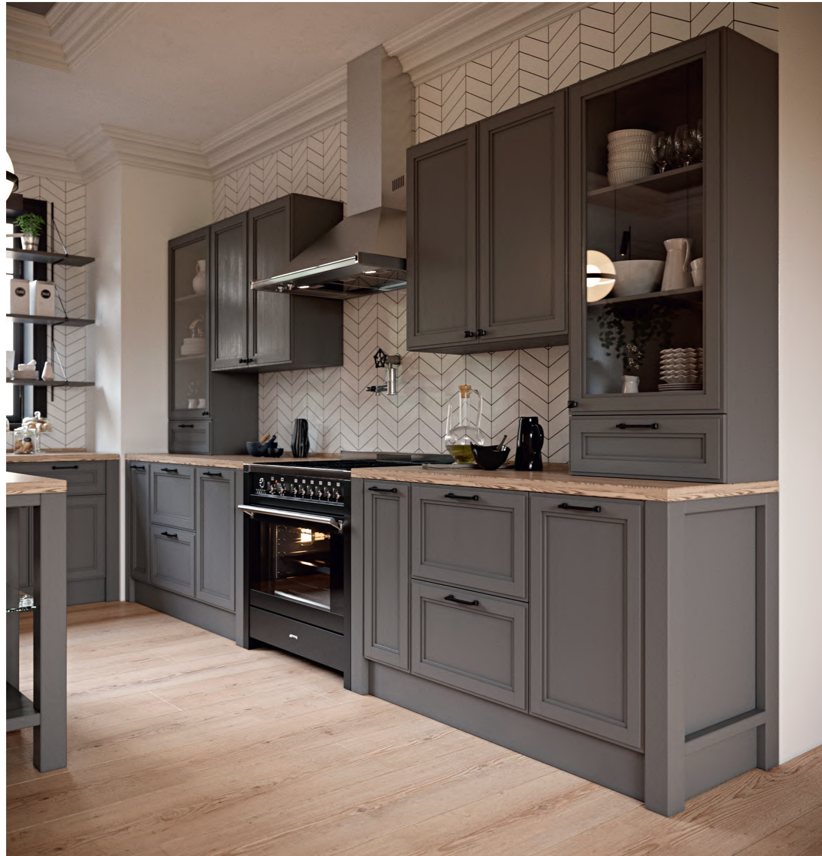
| KITCHENS FOR GREATER INDIVIDUALITY | KÜCHEN FÜR MEHR INDIVIDUALITÄT