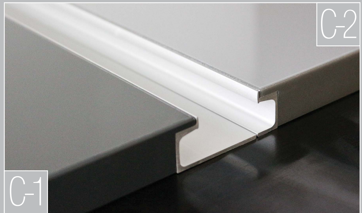
Integrated aluminium handle profiles C-1, C-2, C-3

INTEGRO with its integrated into the cabinet facades handle profiles enables your kitchen to look highly fashionable and elegant. INTEGRO handle profiles allow to create modern and ergonomic design with its straight lines associated with german laconic style. Furthermore integrated handle profiles have one significant feature as a practical matter: using of them allows you to avoid salient elements on your cabinet doors what makes your kitchen safe and convenient.