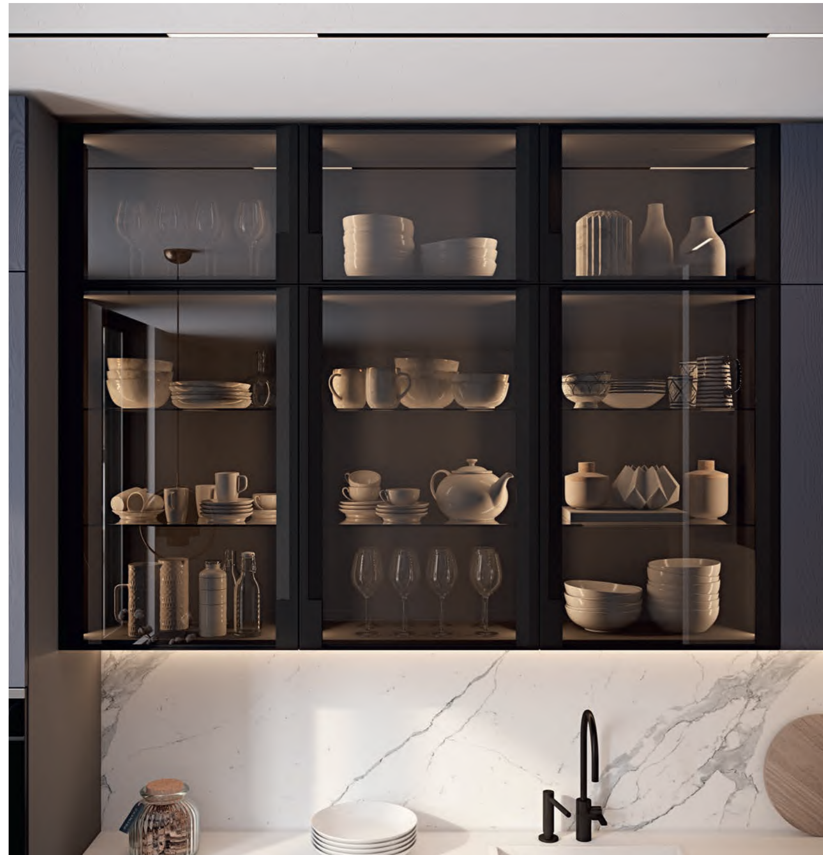
| KITCHENS FOR GREATER INDIVIDUALITY | KÜCHEN FÜR MEHR INDIVIDUALITÄT