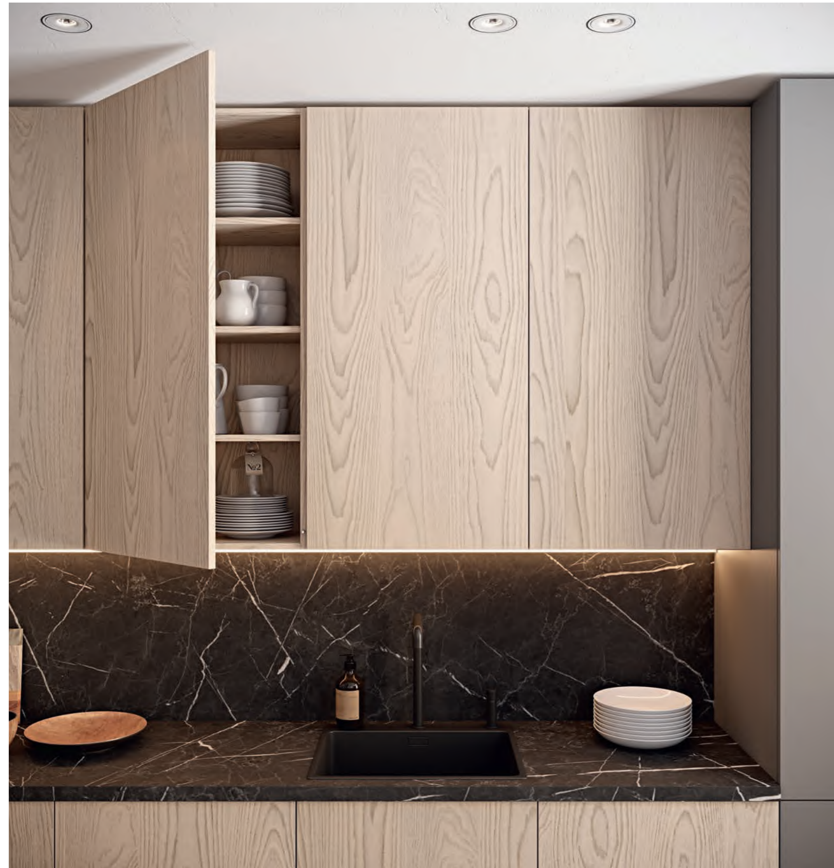
| KITCHENS FOR GREATER INDIVIDUALITY | KÜCHEN FÜR MEHR INDIVIDUALITÄT