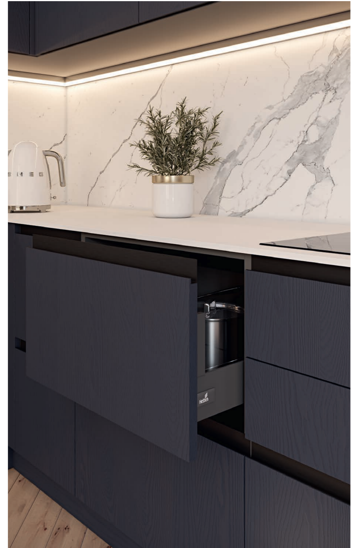
| KITCHENS. DESIGN IDEAS | KÜCHEN. DESIGN-IDEEN