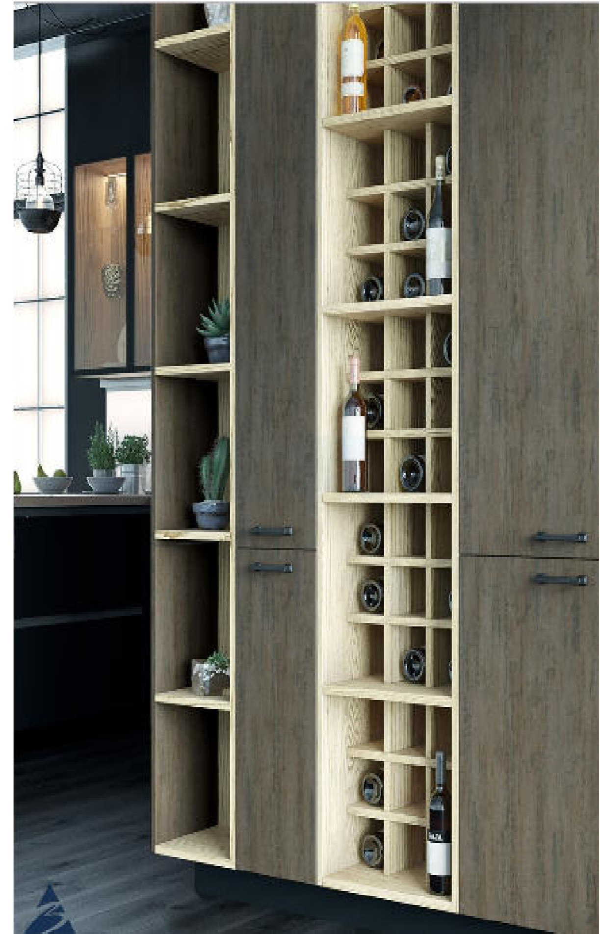
| KITCHENS. DESIGN IDEAS | KÜCHEN. DESIGN-IDEEN